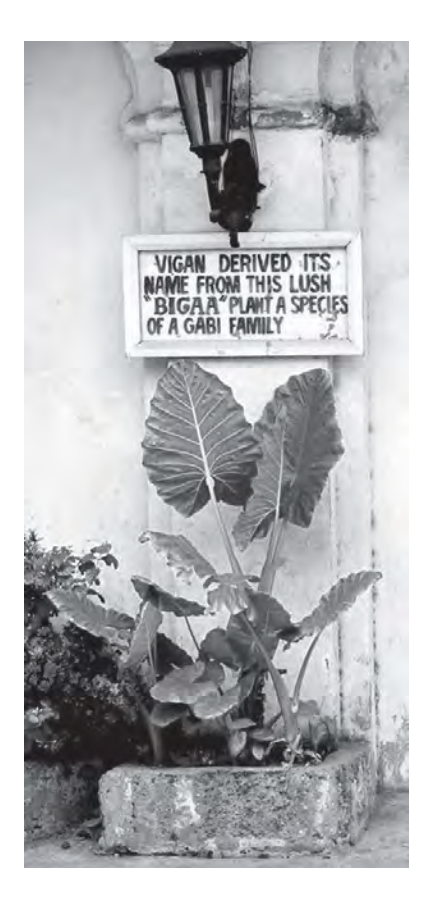
Figure 1 Origin of the name of Vigan, and a specimen of Alocasia macrorrhizos (Vigan town, author's photo)

However, Ferlus (1996) compared 'taro' with 'paddy rice' and makes the argument that taro names were transferred to paddy rice within Austroasiatic. The connection was presumably that both were cultivated in similar fields, whereas basic terms for rice were developed through familiarity with upland rice. Table 11 shows a sample of Ferlus' data<sup>3</sup> which illustrates the process he analyses.