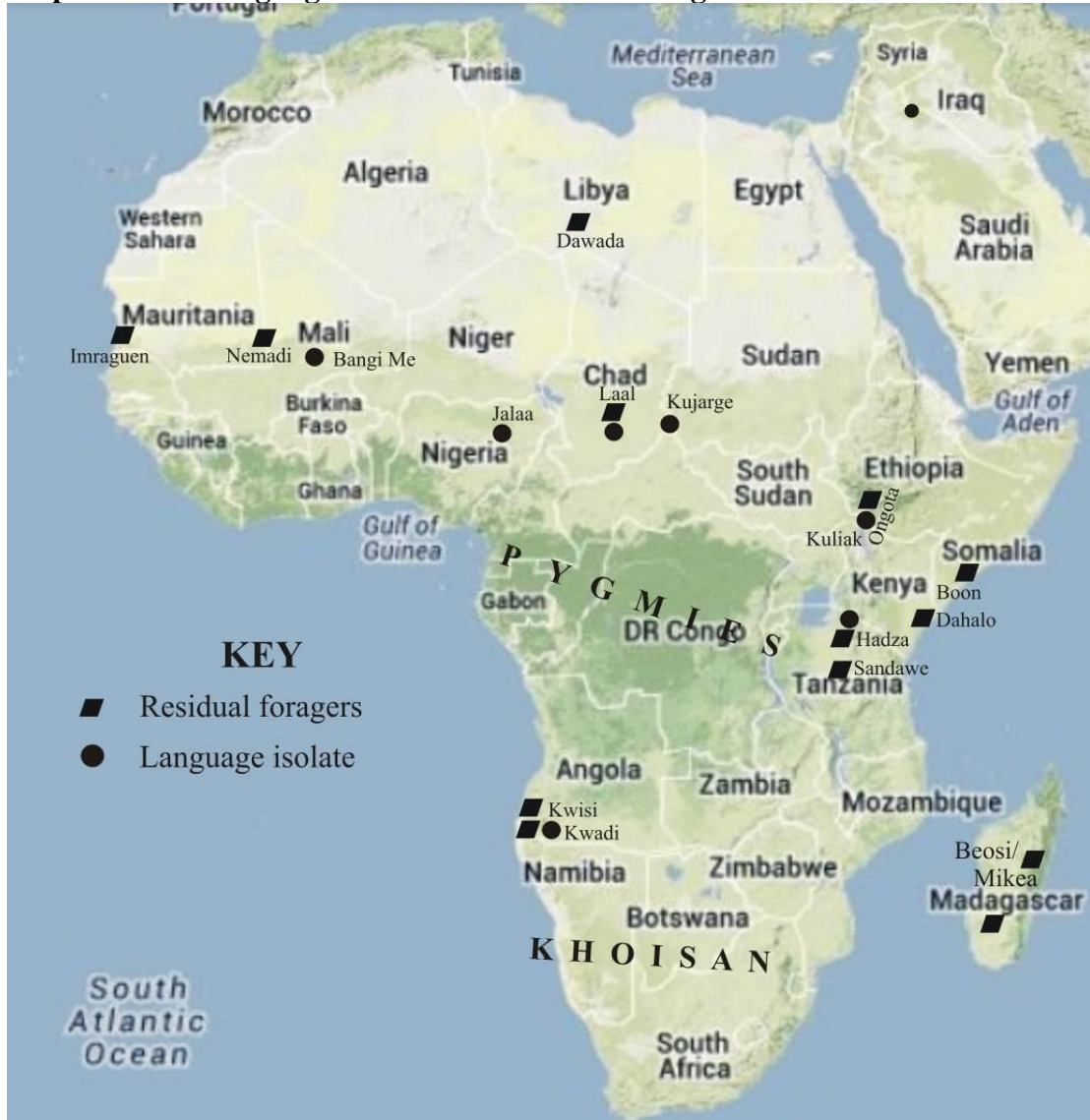
Map 1. Africa: languages isolates and residual foragers

There are number of languages which have been reported initially as isolates, but which seem to be affiliated to known phyla, as shown in Table 3: