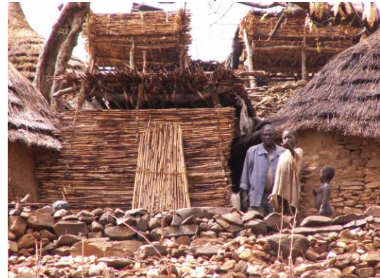
Photo 3. Heiban houses, Nuba Mountains