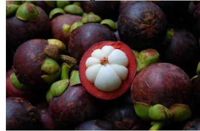
Photo 2. Mangosteen