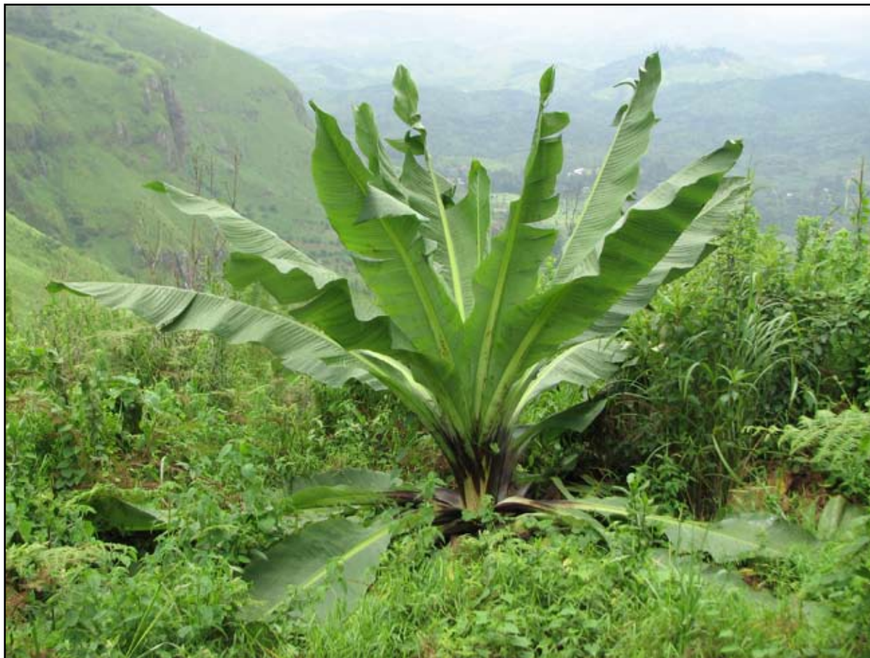
Figure 1. Ensete gillettii (DeWild.) Cheesman near Bamenda, Cameroun (courtesy Robert Hedinger).