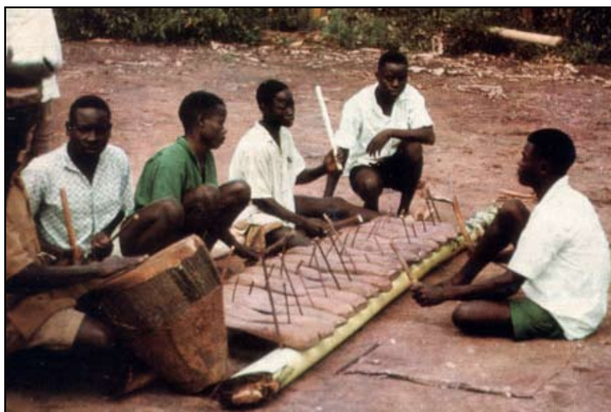
Figure 3. Banana-stem xylophone in Busoga, Uganda.

taro was well established in Senegambia by A.D. 1500, too early for Portuguese navigators to have been instrumental in its diffusion. In the monumental dictionary of Duala by Ittmann (1976), Colocasia is deeply embedded culturally in the coastal areas of Cameroun. The Duala recognise 14 cultivated varieties and have a complex specia-