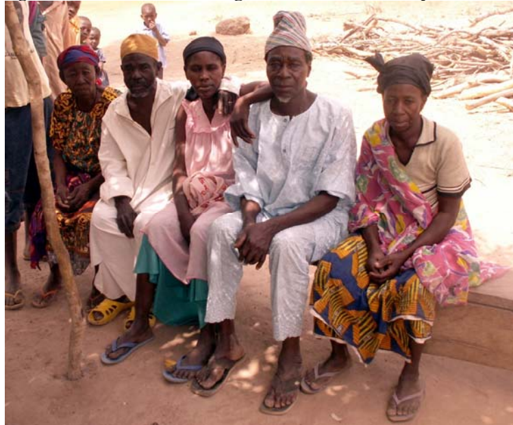
Figure 3. The last remaining 'rememberers' of Mpra in Butei

The chief also noted that there was formerly another village of speakers of the language at a place in the bush known as Kulusu Bito. This village has now dispersed and the site cannot be reached by road. The creation of the Volta Lake in the 1970s has radically altered the geography of this region and further villages across the river might once have existed.