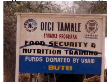
Figure 1. Butei village sign